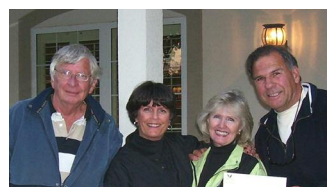
The Carnevale /Maxim team