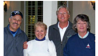
The Hughes /Shkor Team