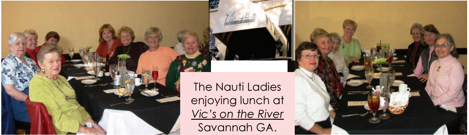
The Nauti Ladies enjoying lunch at Vic's on the River Savannah GA.