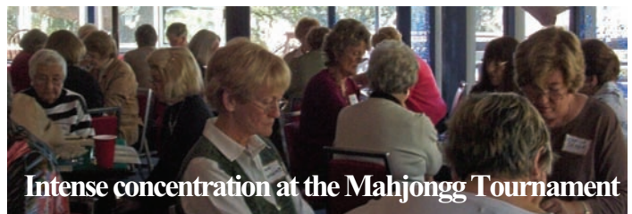
Intense concentration at the Mahjongg Tournament