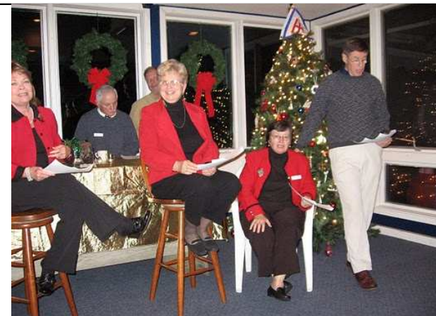
Christmas Party 2009