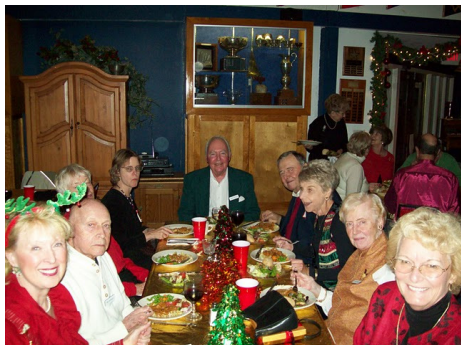
Christmas Party, 2010