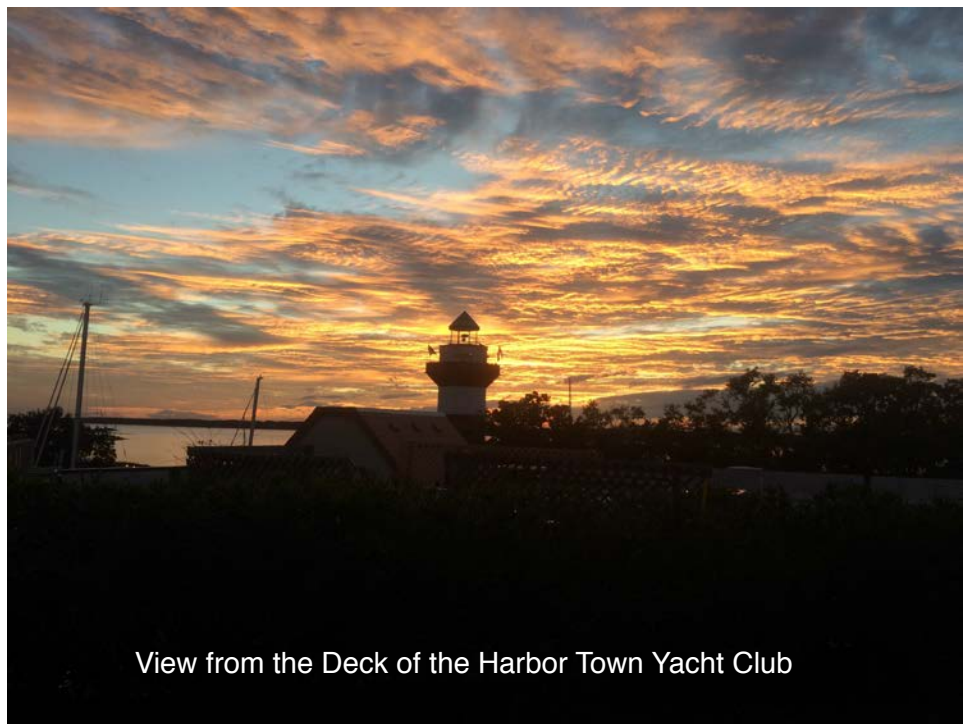
View from the Deck of the Harbor Town Yacht Club

Links on our website provide information about both the Harbour Town Yacht Club and the Yachting Club of America.