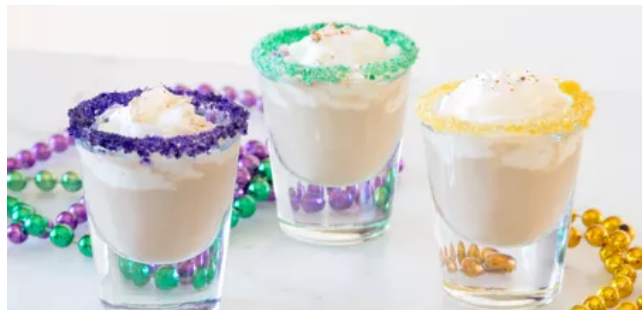
KING CAKE SHOTS