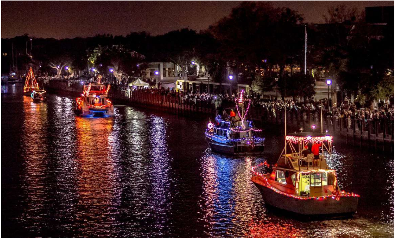
Beaufort, SC Boat Parade