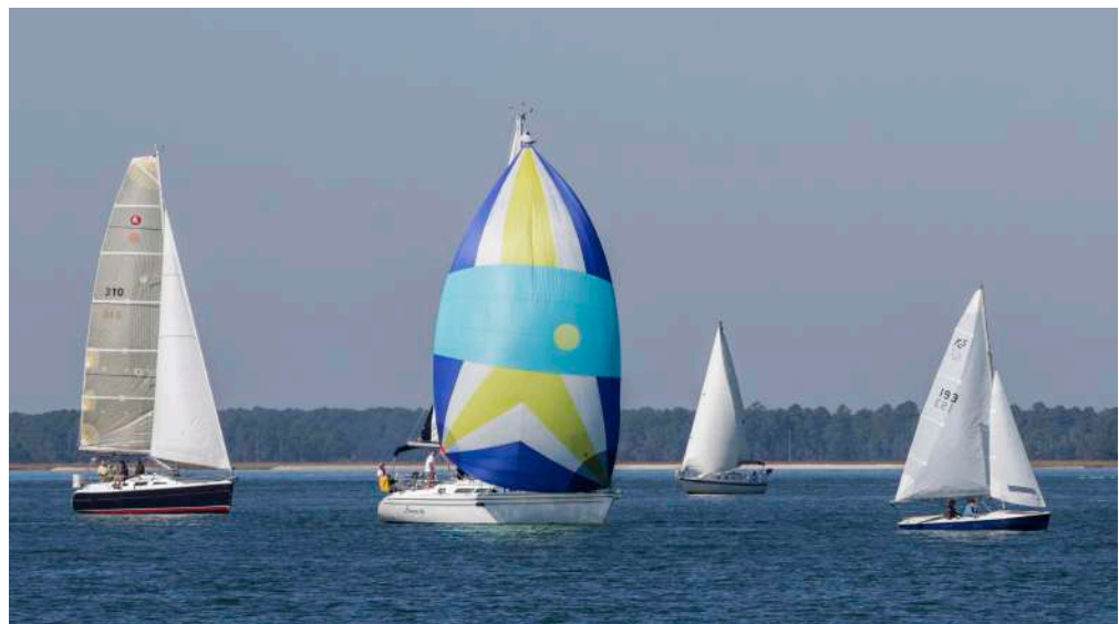
Harbour Town Club Race