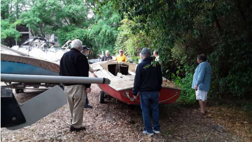
Sailing Storage Clean-up

I made a huge to do list today. I just can't figure out who's going to do it.