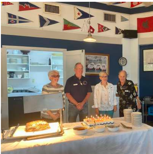
Celebrating April birthdays