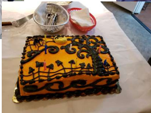
Celebrating October birthdays