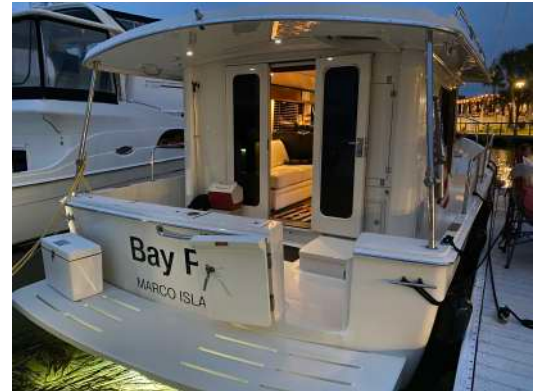
Checking out Westerveldt's beautiful new boat.