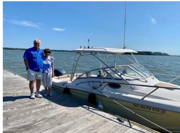
Impromptu trip to Buffalos at Palmetto Bluff.