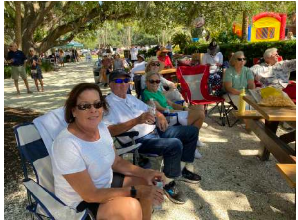
Members enjoying Fall Festival at Harbourtown with Deas Guyz.