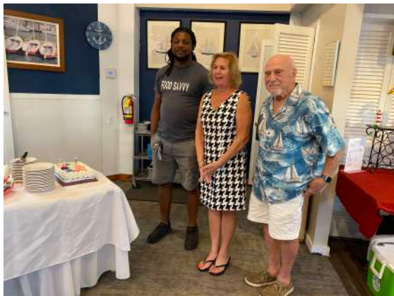
Celebrating September birthdays.