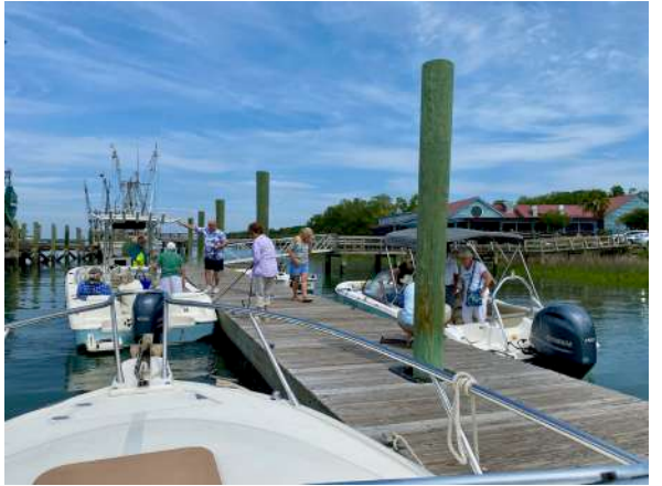
Docking at 11th Street Fish Camp

It has been an up and down year for our lunch cruises, with restaurant closings, weather forecasts and alternative local festivals; but we have had lots of great cruises. And, with a little luck, we'll close out the season with great events. Here they are: