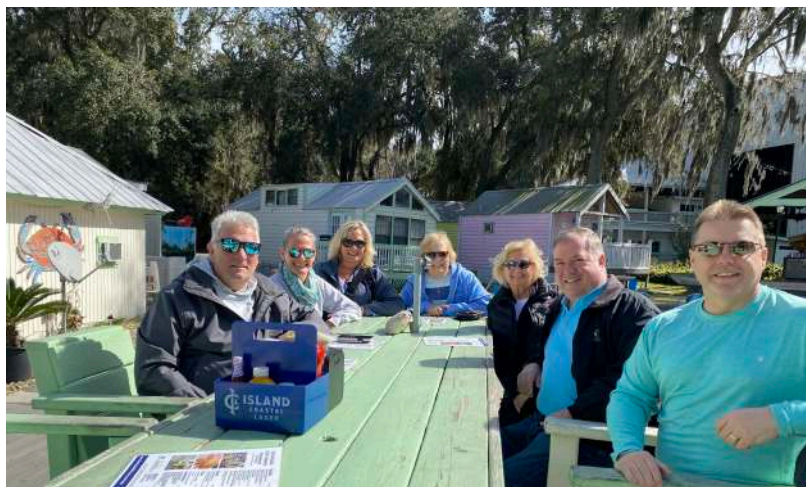
Winter boating on the Salt Time . Although cool on the way over to Daufuskie Island Crab Shack, the sun came out and all enjoyed the beautiful day.