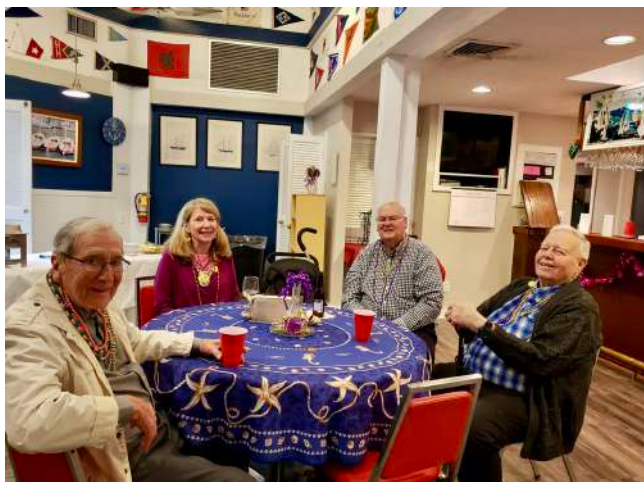
Members socializing at the club.