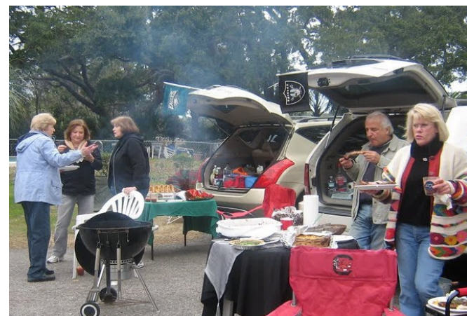
Last January's Tailgate Party - Let's warm it up a bit this September